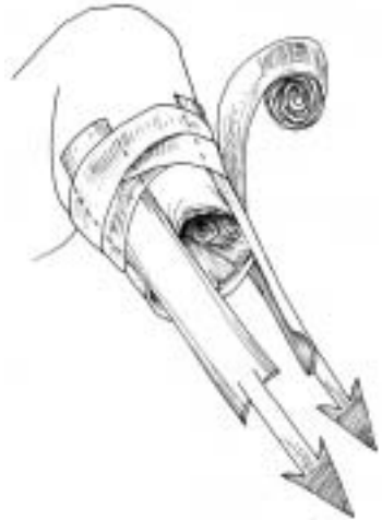
Fig. 25-1. Skin Traction